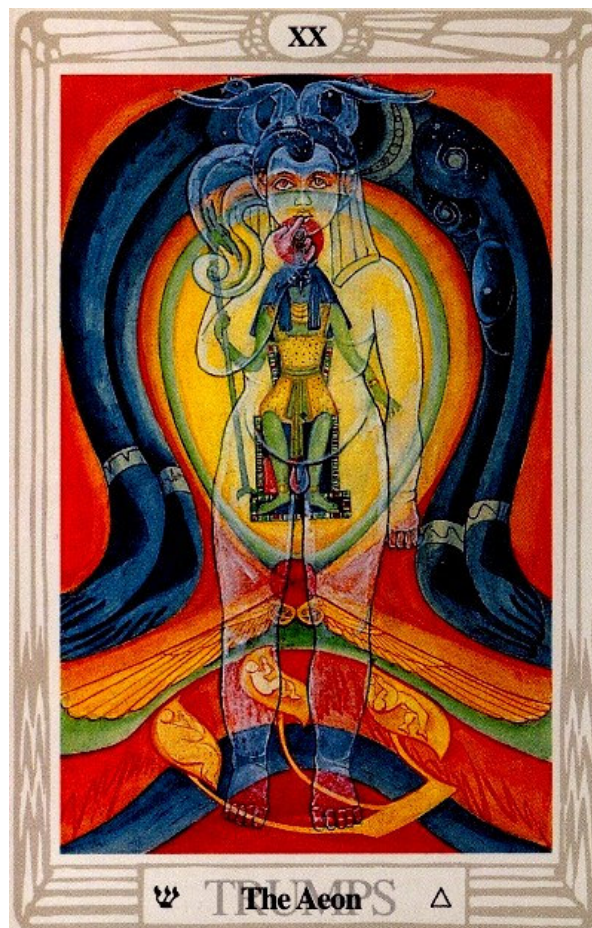
Crowley's Thoth Tarot version

In the Gnostic tradition Horus is Io (pronounced Aho ). In the Thoth deck we see him with forefinger pressed to his lips. This pose indicates the Hermetic mysteries of which he is keeper. The letters I and O connote the Phi ratio or geometric harmony of the universe.