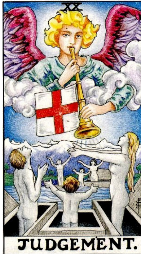
The Rider-Waite version

The design intentionally represents the supernal triangle on the Kabalistic Tree of Life, that is, the three highest Sephiroth known as Kether, Chokmah and Binah.