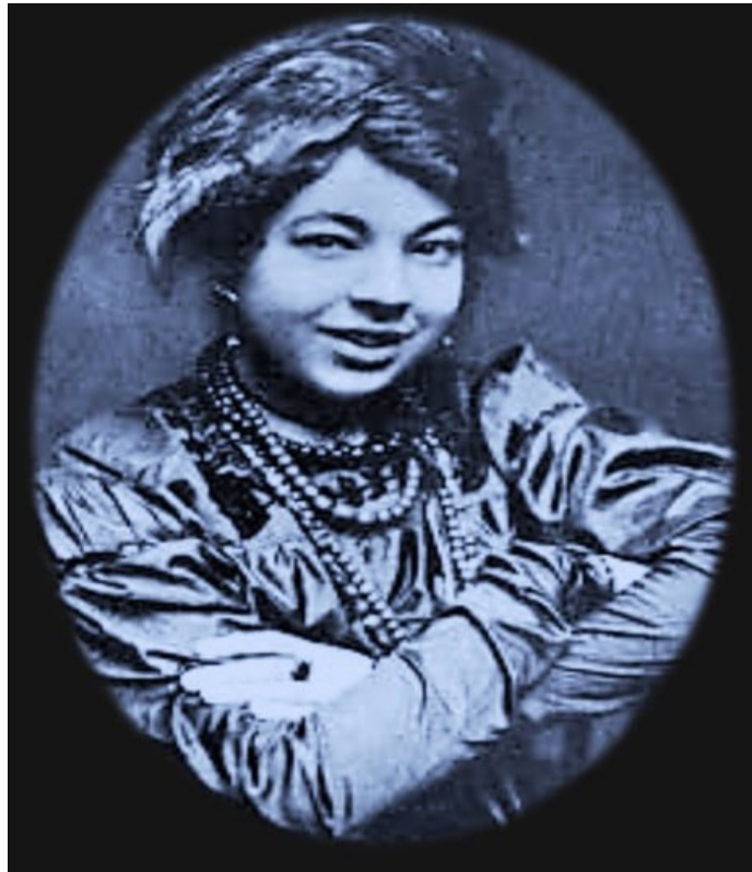
Pamela Coleman Smith, designed and painted the Rider-Waite deck. She died in poverty and obscurity.

As Frater Achad emphasized, during the Aeon of Horus men learn the principles for the "right rulership" the themselves. What most bandwagon apostles of "Crowleyanity" forget is that true freedom ultimately involves considerable personal responsibility. No masters above, certainly, but no slaves below. This is why Crowley was not advocating a dionysian "Hippydom." That is not what his Aeon was about.