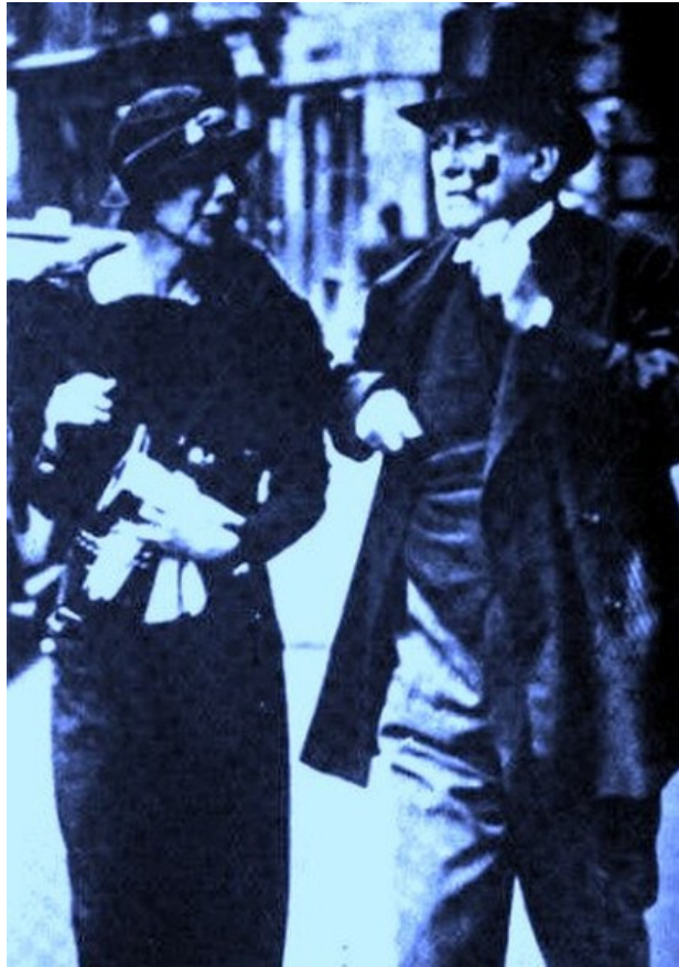
Crowley with Lady Frieda Harris, the artist who painted the enigmatic Thoth Deck.

Their vision finally came into being, and competent critics and adepts agree that along with the Rider-Waite deck, Crowley's Thoth Tarot is one of the most precious endowments to humanity.